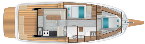
Lower deck - 2 cabins / 2 heads